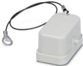
Protective cover for HC-COM-K housing... for female contact inserts

Please be informed that the data shown in this PDF Document is generated from our Online Catalog. Please find the complete data in the user's documentation. Our General Terms of Use for Downloads are valid ( http://download.phoenixcontact.com )