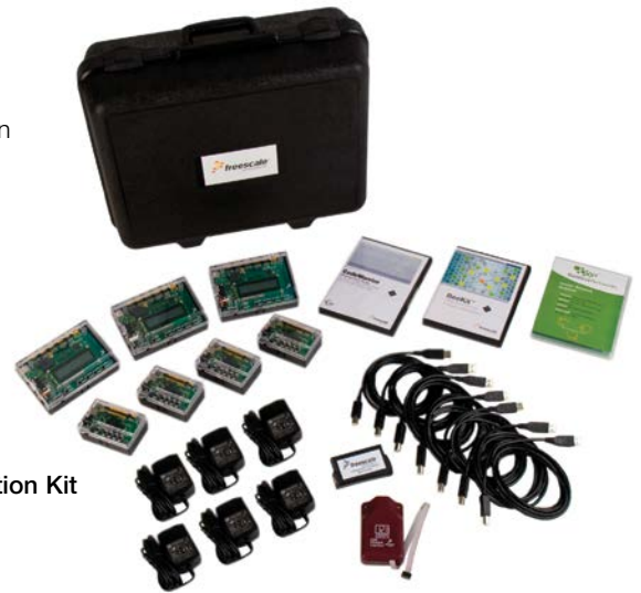
1321X Evaluation Kit