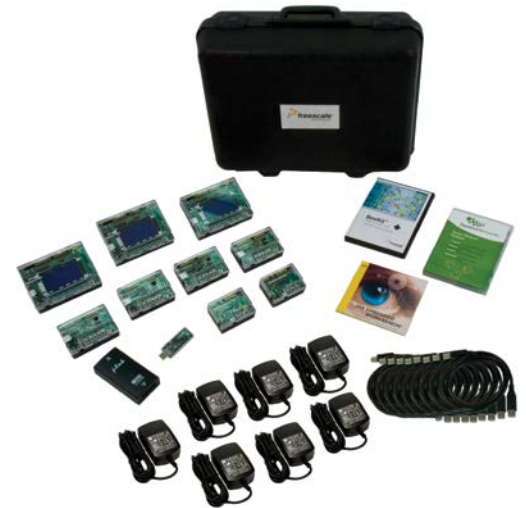
1322X Evaluation Kit