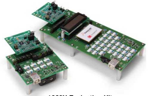
1323X Evaluation Kit