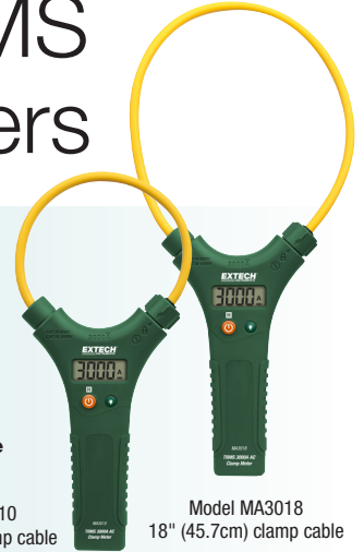
Model MA3018 18" (45.7cm) clamp cable