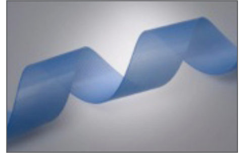
Temp-Flex FEP MIL-Spec Approved Flat-Ribbon Cable

Commercial FEP Flat-Ribbon Cable, MIL-Spec Approved FEP Flat-Ribbon Cable