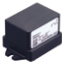
10A PC board type