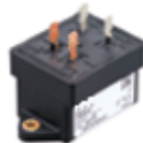
10A TM type