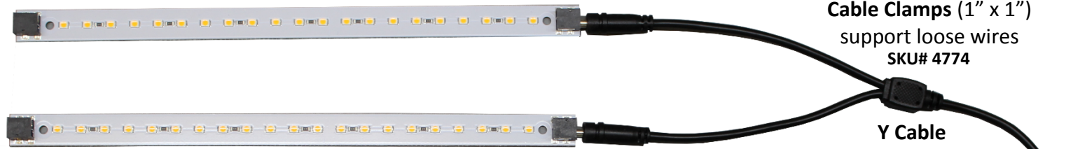
Cable Clamps (1" x 1") support loose wires SKU# 4774

Inspired LED's unique line of Interconnect Accessories are compatible with 3.5mm x 1.3mm DC input/output jacks. Cables are available in standard or custom lengths, and all interconnect products combine easily with Inspired LED flex strips and LED panels to create the perfect low-voltage lighting system for any location.