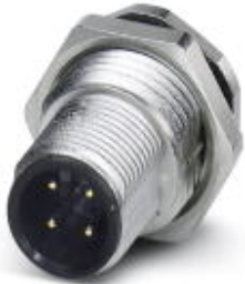
Flush-type connector, 4-position, Flush-type plug, straightLink:M12, A-coded, Solder pins

Please be informed that the data shown in this PDF Document is generated from our Online Catalog. Please find the complete data in the user's documentation. Our General Terms of Use for Downloads are valid ( http://download.phoenixcontact.com )