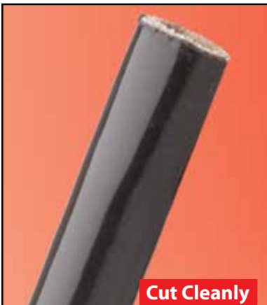
Cut Cleanly Scissors

SF sleeving is rated to 392°F. (Class H), is abrasion resistant, and maintains its flexibility in low temperature environments. It is available in a very wide range of sizes, and is ideal for use in appliance assemblies, wire harnesses, transformer leads, power supplies, motor coil and heater leads.