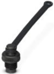
M8 sealing cap made of plastic with fixing band, for free M8 sockets, with 3.0 mm fastening eye

Please be informed that the data shown in this PDF Document is generated from our Online Catalog. Please find the complete data in the user's documentation. Our General Terms of Use for Downloads are valid ( http://download.phoenixcontact.com )