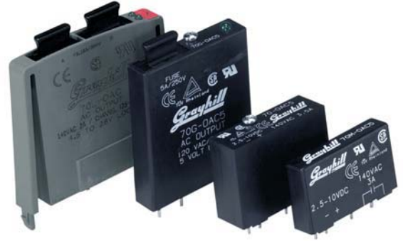
70L-OAC 70G-OAC 70-OAC 70M-OAC