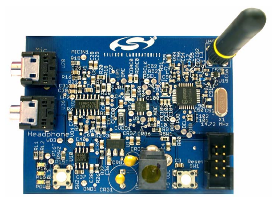
Figure 1. Wireless Voice Transceiver Board

Note: This design operates the RF transceiver at 908 MHz . This frequency can be modified in firmware. Silicon Labs' USB debug adapter and software tools are required to recompile the code and reprogram the boards.