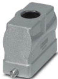
HEAVYCON B16 sleeve housing, for single locking latch, height: 65 mm, with 1 x M25 thread, straight cable outlet

Please be informed that the data shown in this PDF Document is generated from our Online Catalog. Please find the complete data in the user's documentation. Our General Terms of Use for Downloads are valid ( http://phoenixcontact.com/download )