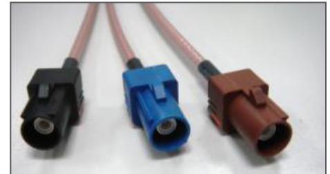
FAKRA II SMB Jacks

73403 FAKRA II SMB Cable Plugs and Jacks