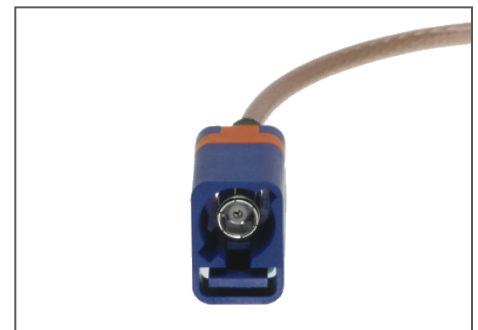
FAKRA II SMB Plug