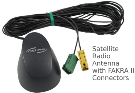
Satellite Radio Antenna with FAKRA II Connectors