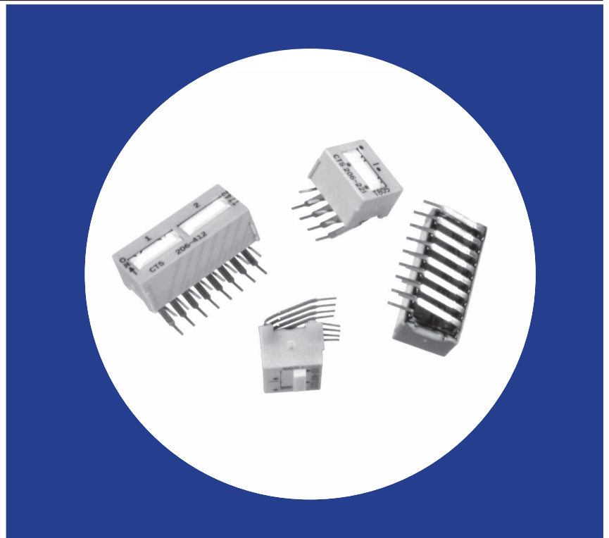
Series 206RA – Premium Gold Plated Contacts Series 208RA – Economical Tin Plated Contacts