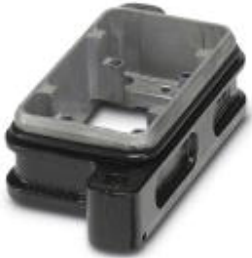
HEAVYCON B10 panel mounting base, HPR series, for screw locking, for increased environmental and EMC requirements

Please be informed that the data shown in this PDF Document is generated from our Online Catalog. Please find the complete data in the user's documentation. Our General Terms of Use for Downloads are valid ( http://phoenixcontact.com/download )