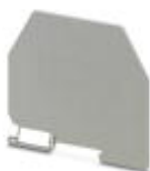
Separating plate, Length: 99 mm, Width: 2 mm, Height: 90 mm, Color: gray