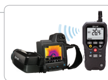
Wireless METERLiNK ® Communication via Bluetooth ®