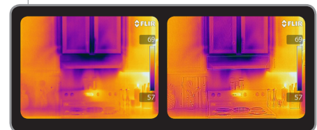
Original IR Image on the Left and with MSX ™ Enhancement on the Right image