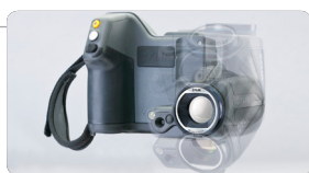
Built-in 3.1MP Digital Camera, LED Lamp, Laser Pointer, Fine Focus Adjust, and Auto focus & Image Capture Button. 120° Rotating Lens with 8X Continuous Zoom