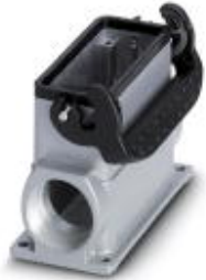
HEAVYCON box mounting base B16, with single locking latch, height 67 mm, with supports 2xM25

Please be informed that the data shown in this PDF Document is generated from our Online Catalog. Please find the complete data in the user's documentation. Our General Terms of Use for Downloads are valid ( http://download.phoenixcontact.com )