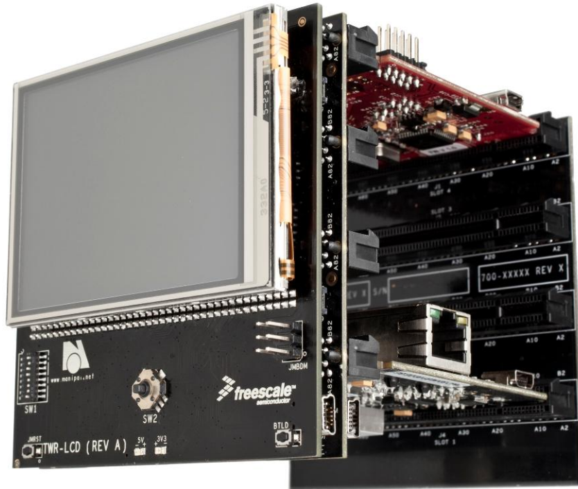
Figure 2 - Tower System with TWR-LCD