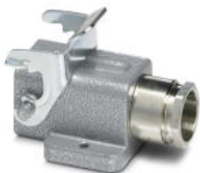
HEAVYCON D7 box mounting base, with single locking latch, height 25.5 mm, with 1 x Pg11 screw connection, with open bottom, zinc

Please be informed that the data shown in this PDF Document is generated from our Online Catalog. Please find the complete data in the user's documentation. Our General Terms of Use for Downloads are valid ( http://phoenixcontact.com/download )