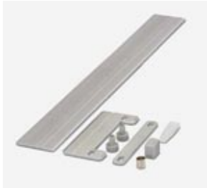
Spacer rollers for regular rail spacing, required for ground terminal blocks, material: Nickel-plated brass

Please be informed that the data shown in this PDF Document is generated from our Online Catalog. Please find the complete data in the user's documentation. Our General Terms of Use for Downloads are valid ( http://phoenixcontact.com/download )