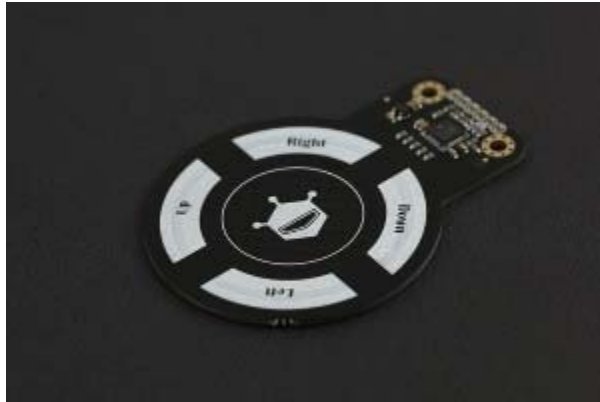
3D Gesture Sensor mini