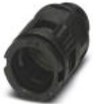
Cable gland, metric thread, IP68/69k protection, straight

Screw connection - WP-G HF IP69K M40 BK - 3240887