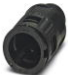
Cable gland, metric thread, IP66 protection, straight

Screw connection - WP-G HF IP66 M40 BK - 3240901