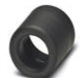
End sleeves as cable protection

Cable protection end sleeve - WP-SC PA HF 42,5 BK - 3240987