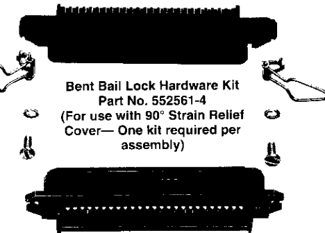
Bent Bail Lock Hardware Kit Part No. 552561-4 (For use with 90° Strain Relief Cover— One kit required per assembly)