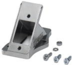
45° adapter for panel mounting frames

Please be informed that the data shown in this PDF Document is generated from our Online Catalog. Please find the complete data in the user's documentation. Our General Terms of Use for Downloads are valid ( http://phoenixcontact.com/download )