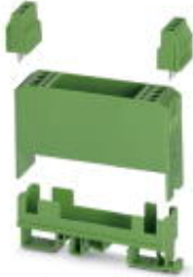
Electronic housing set, consisting of electronic housing and printed circuit termination blocks, pitch 5

Please be informed that the data shown in this PDF Document is generated from our Online Catalog. Please find the complete data in the user's documentation. Our General Terms of Use for Downloads are valid ( http://phoenixcontact.com/download )