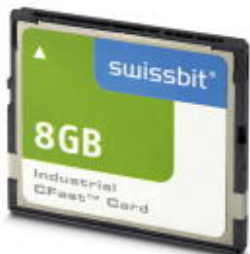
16 GB CFAST® card

Please be informed that the data shown in this PDF Document is generated from our Online Catalog. Please find the complete data in the user's documentation. Our General Terms of Use for Downloads are valid ( http://phoenixcontact.com/download )