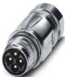
Coupler connector, straight, SPEEDCON locking, M17, Number of positions: 5+3+PE, Type of contact: Pin, Crimp connection, shielded: yes, Cable diameter: 8 mm...10 mm

Please be informed that the data shown in this PDF Document is generated from our Online Catalog. Please find the complete data in the user's documentation. Our General Terms of Use for Downloads are valid ( http://phoenixcontact.com/download )