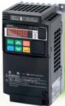
AC Drive Option