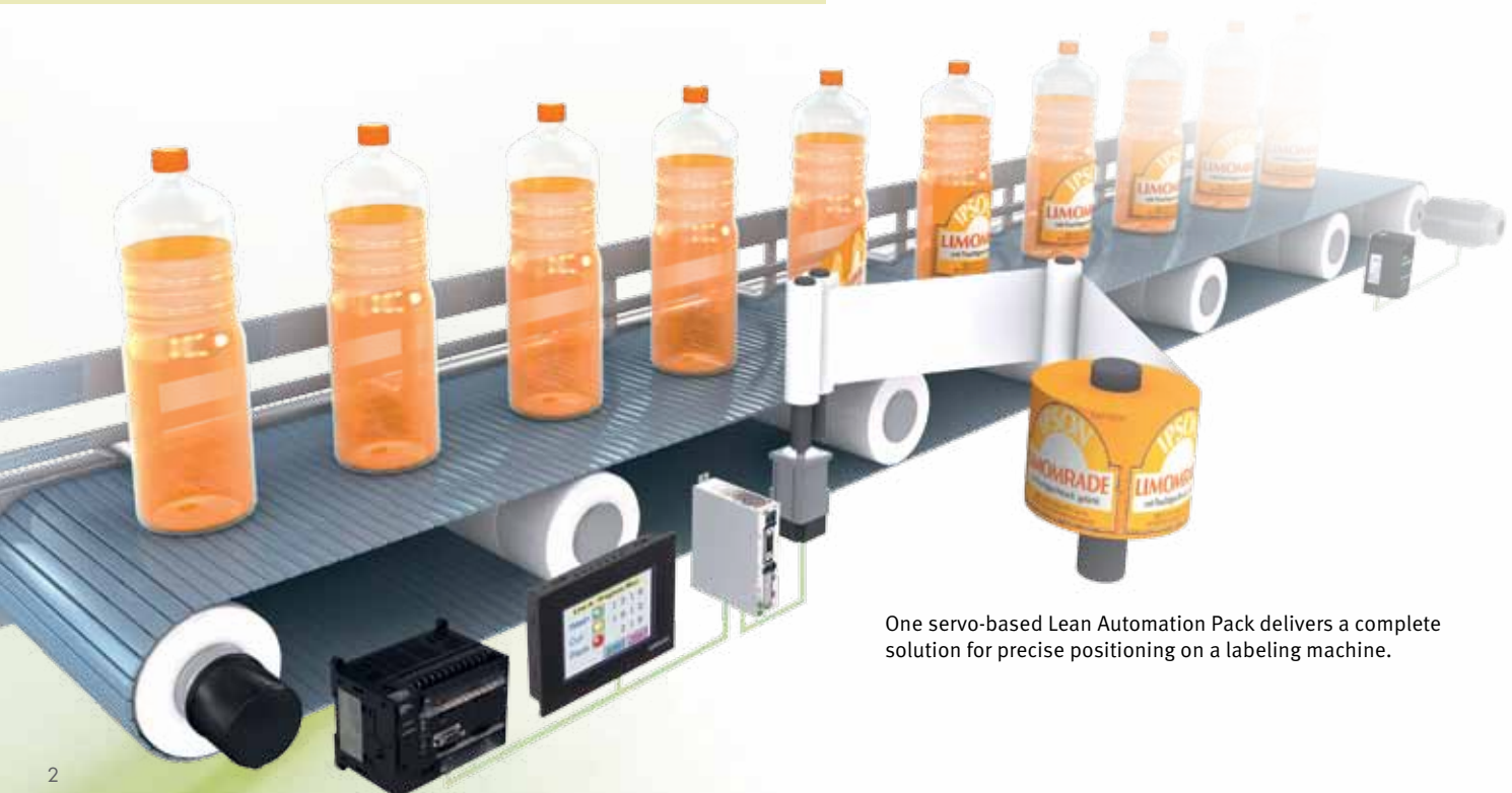
One servo-based Lean Automation Pack delivers a complete solution for precise positioning on a labeling machine.