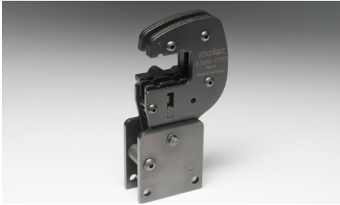
Crimp Head Adapter: Type 4C (63816-0300)