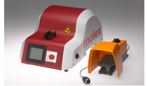
Electric Crimping Machine and Electric Foot Pedal with Safety Cover and Connecting Cable