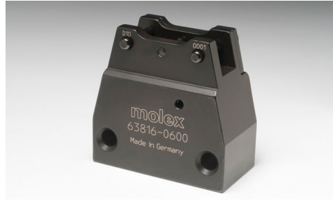
Crimp Head Adapter: Type 4A (63816-0600)