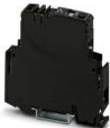
Electronic circuit breaker, 1 reset input, nominal current: 2 A

Please be informed that the data shown in this PDF Document is generated from our Online Catalog. Please find the complete data in the user's documentation. Our General Terms of Use for Downloads are valid ( http://phoenixcontact.com/download )