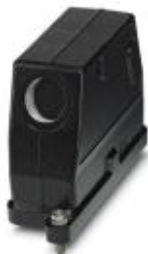
HEAVYCON B24 sleeve housing, HPR series, with screw locking, with M32 thread, lateral outlet, for increased environmental and EMC requirements

Please be informed that the data shown in this PDF Document is generated from our Online Catalog. Please find the complete data in the user's documentation. Our General Terms of Use for Downloads are valid ( http://phoenixcontact.com/download )