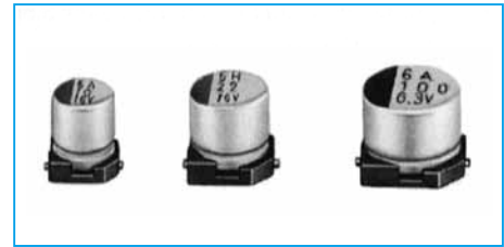
Marking color : Black print