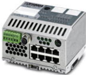
Ethernet Smart Managed Compact Switch with eight 10/100 Mbps RJ45 ports, PROFINET mode (default)

Please be informed that the data shown in this PDF Document is generated from our Online Catalog. Please find the complete data in the user's documentation. Our General Terms of Use for Downloads are valid ( http://phoenixcontact.com/download )