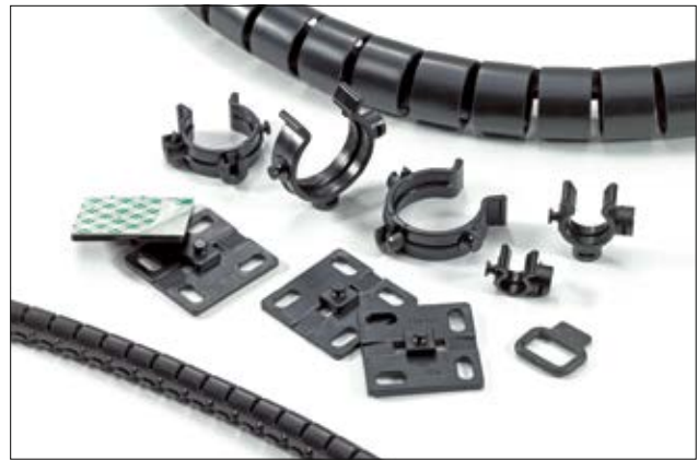
The Helawrap accessory set for bundling, fixing and protecting multiple cable runs.